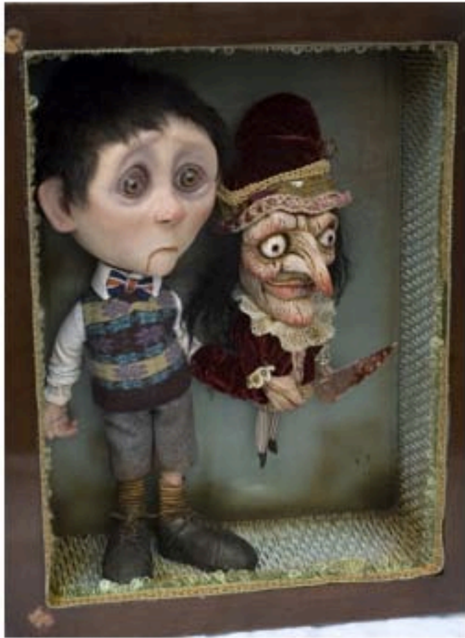
Work by Skeleton Heart