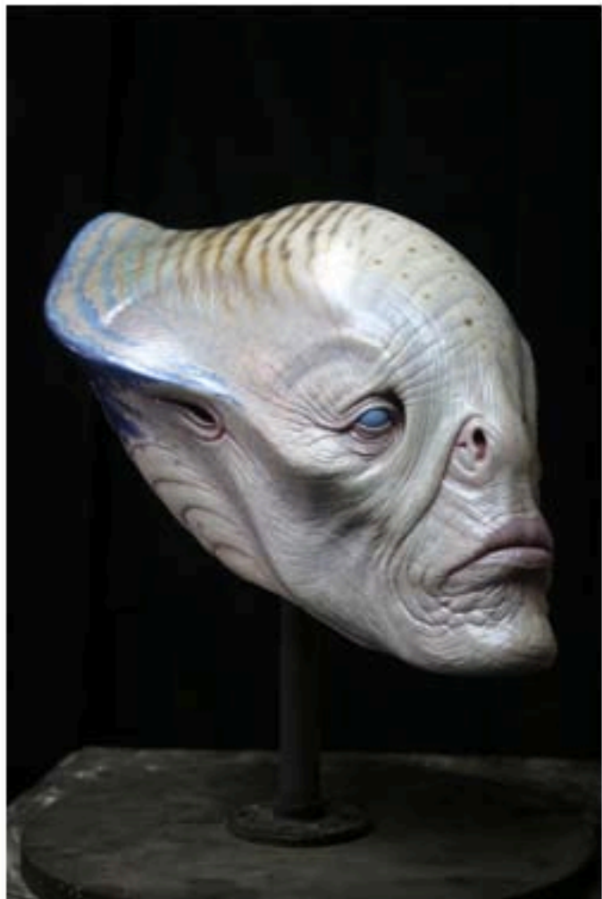
Work by Casey Love