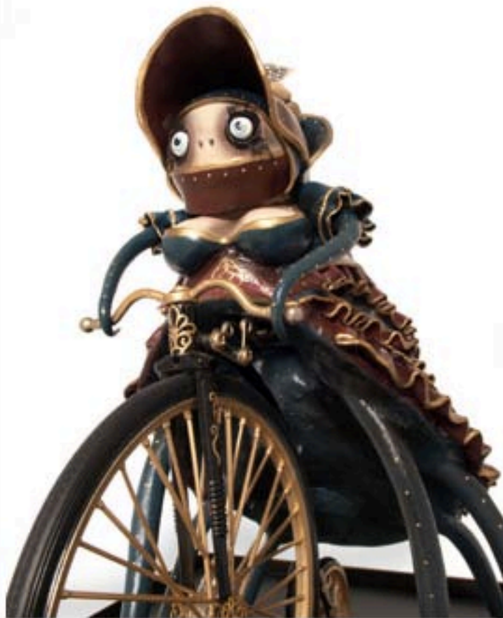
Work by Seymour