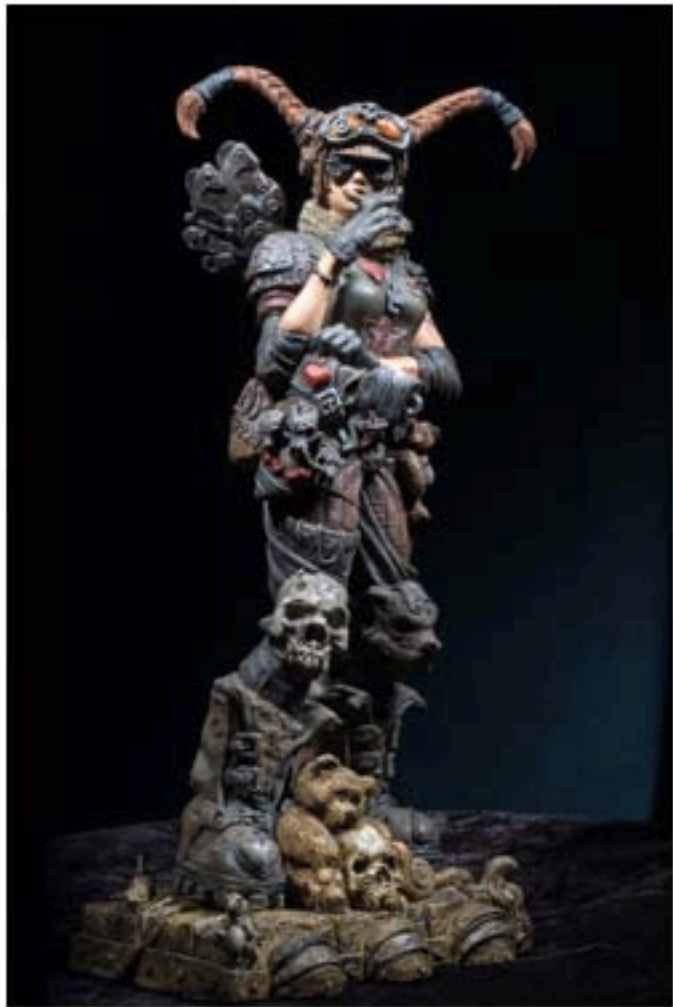
Work by the Shiflett Brothers