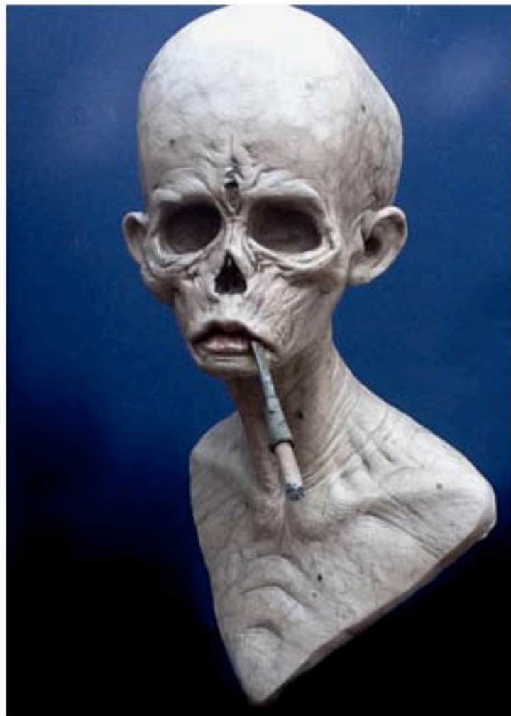
Work by Cliff Wallace