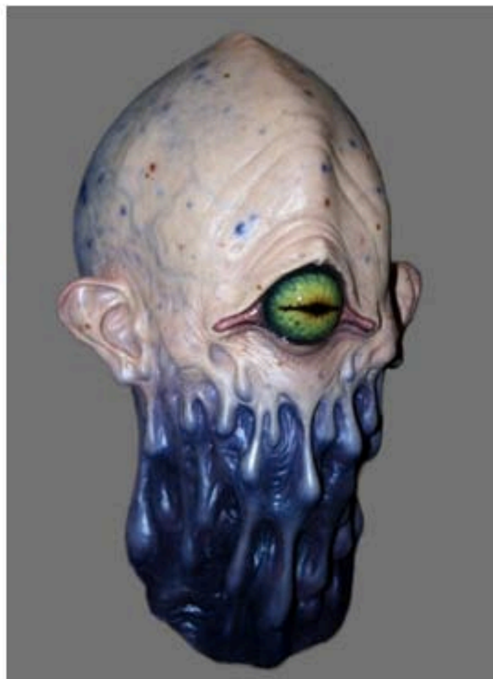
Above work by Casey Love

The exhibit runs through Oct. 23 at Strychnin Gallery Berlin, located at Boxhagener Straße 36, 10245 Berlin, Germany. For more information, go to www.strychnin.com .