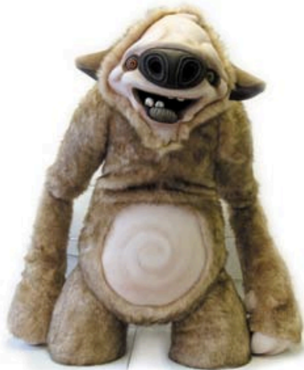
Work by Stitches and Glue